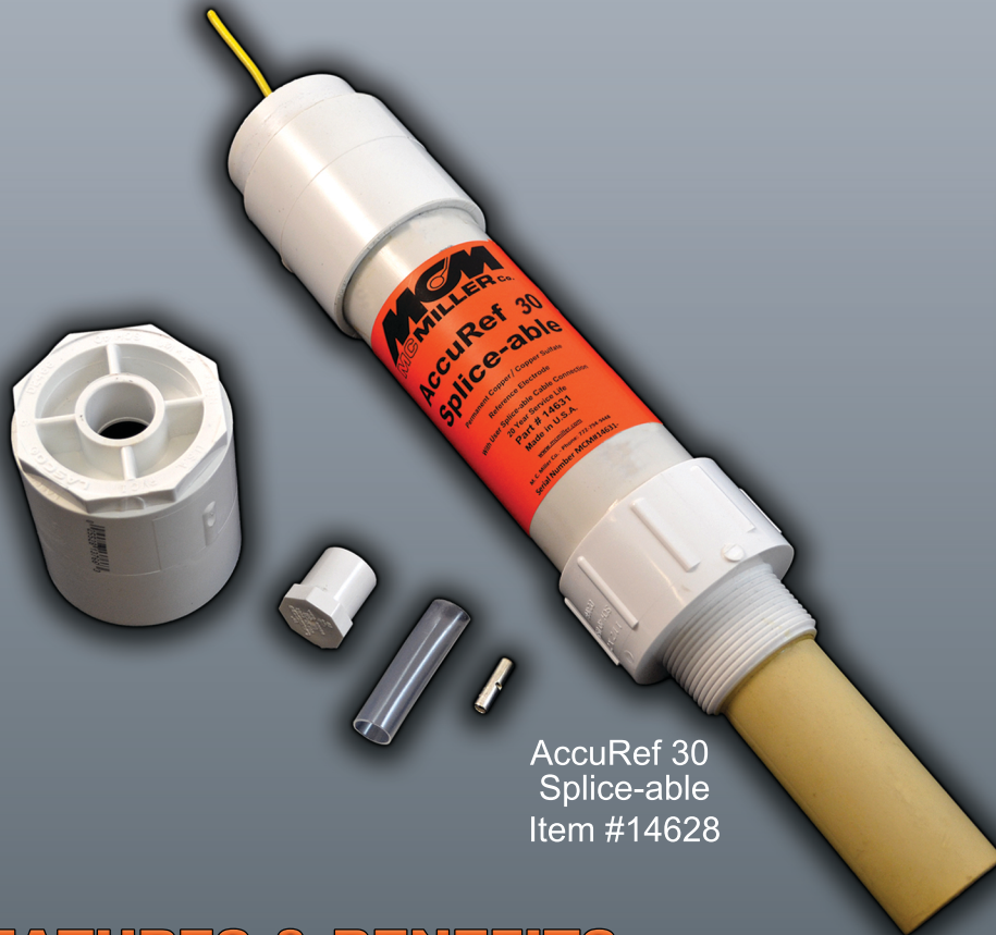
AccuRef 30 Splice-able Item #14628